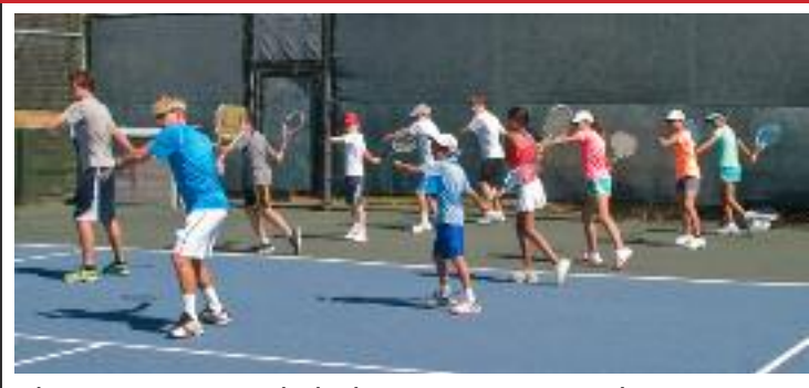
This Program gives kids the opportunity to play competitive tennis at their appropriate level, as a member of a team, promoting sportsmanship, camaraderie and fun!